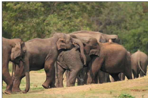
Elephants at Kala Wewa, Sri Lanka

Most of the jungles in Sri Lanka’s northern and eastern regions were inaccessible for wildlife authorities during the fighting between government troops and Tamil Tiger rebels. However, with the ending of hostilities in May 2009, the wildlife department has begun managing some of the