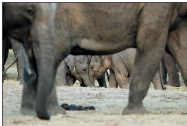
Playing baby elephants (Sri Lanka)

The first influx of Bhutanese refugees into Nepal began in the 1990s when more than 100,000 ethnic Nepalese of Hindu background who had lived in Bhutan for centuries were expelled.