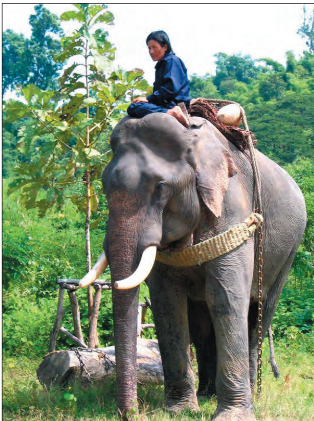
Trained bull elephant in the Bago Yoma Mountains of Myanmar

A herd of four wild elephants has destroyed over 2,000 banana plants in Kampung Batu 8 here over the past three weeks, causing huge losses for more than 30 farmers. The farmers' attempt to frighten away the animals by exploding firecrackers and setting bonfires proved futile. Over the past week, Wildlife Protection and National Parks Department personnel failed to trace the elephants which often came to the banana plantation only at night.