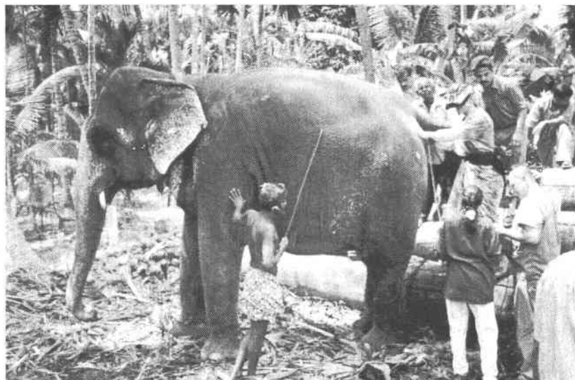
Plate 1 Demonstrating ultrasound in Kerala