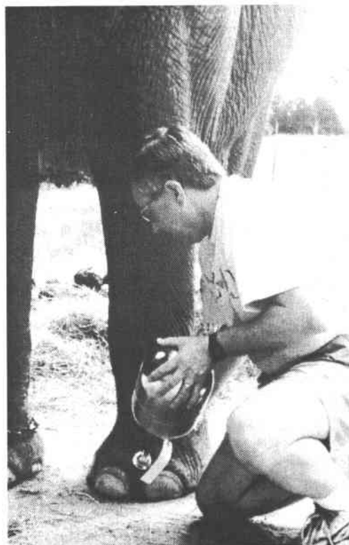
Plate 4 Demonstrating the use of ultrasound in Kerala