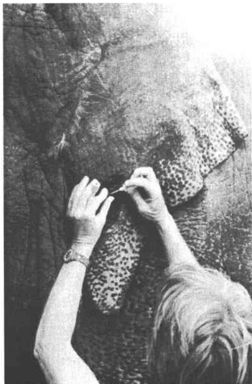
Plate 2 Collecting blood sample from an elephant's ear