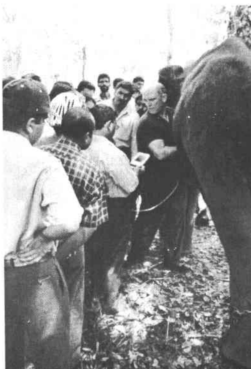
Plate 5 Demonstrating the use of ultrasound in Assam