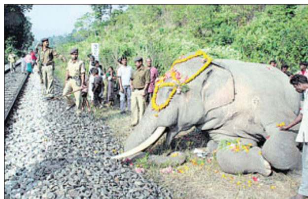
Figure 2. Elephant death at Sevoke-Mongpong stretch (18. Nov. 2006).

Corresponding author's e-mail: muktiroy@rediffmail.com