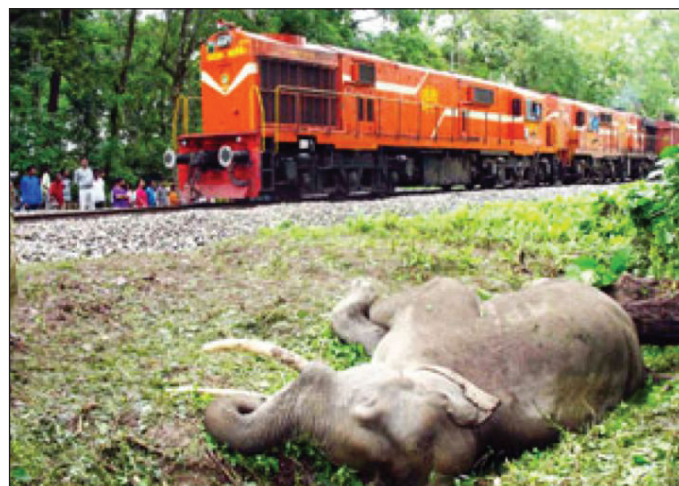
Figure 3. Elephant death at Rajabhatkhawa area (28. May 2006).

* 1-26: before gauge conversion, 27-36: after gauge conversion