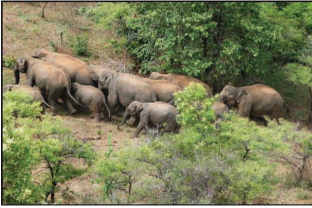
Figure 3. A herd with calves in the park.

driving operations and farmers living adjacent to the park boundary opine that the number to be more than 200, with the migratory elephants moving in, during the cropping season.