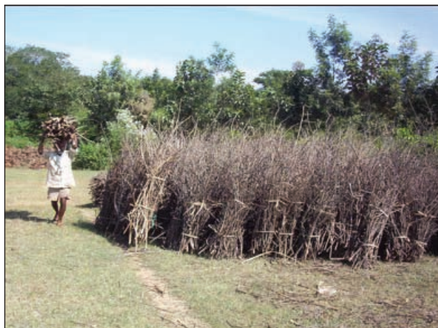
Figure 5. Fire wood collection by the local community in the park.

These ever increasing human activities around park, shrinking habitat due to encroachments, fragmentation by roads and degradation of habitat due to biotic pressures such as fire wood collection (Fig. 5), cattle grazing and poaching of trees perhaps are contributing to reduction in the area available for elephants to use in the park leading to elephant incursions into the surrounding human habitations culminating in the human elephant conflict.