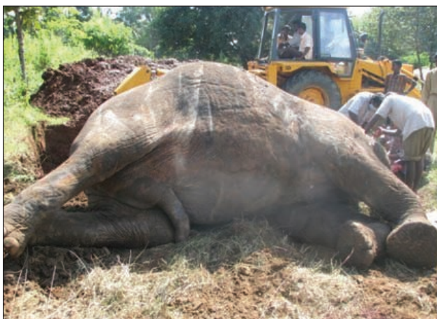
Figure 7. Elephant death due to electrocution in retaliation to crop raids..

of human-elephant conflict. This requires an in-depth understanding of the elephant population, its habitat usage pattern, status of habitat in terms of types, fragmentation etc. Information on land use around the park particularly on cropping patterns will be crucial. The status of crop raiding, economic losses to farmers due to depredations and destruction of property and loss of human life needs to be clearly understood. Information on elephant mortality will also be crucial to the understanding of the overall conflict status in this region. Data on elephant barriers and their efficacies will throw light on reasons for elephant incursions to human settlements. Studying community perspective on elephants and conflict will be imperative to any community based initiatives to mitigate human elephant conflict in this area.