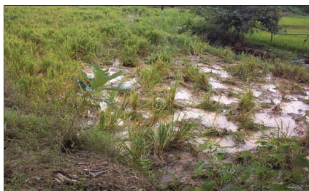
Figure 6. Crop damage by elephants in the park.

The relatively small size of this park, already fragmented and degraded, coupled with a high density elephant population is jeopardizing the local community through the ever increasing human elephant conflict. The season of arrival of the migratory elephants also coincides with