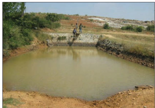
Figure 4. Traditional water harvest structure.

In addition, the park has a network of about 144 km forest roads covering most of the interior areas